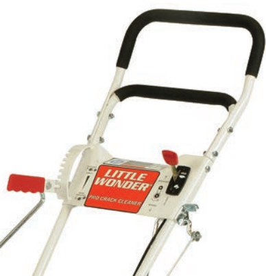
To accommodate taller operators, an extension handle kit (p/n 970389) is sold separately to increase the height of the unit. The standard handle will work perfectly for operators 6'1" and under.