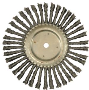
The twisted spring steel wire wheel (p/n 4046) is extra durable, and the choice of many contractors in the paving industry.

The LITTLE WONDER® Pro Crack Cleaner is a dedicated unit designed to clean cracks and crevices in asphalt and concrete surfaces. We understand that clearing away debris and undergrowth is extremely important before laying down crack filler and applying sealant. Using the Pro Crack Cleaner will save you time and allows for a more professional longer lasting crack fill and sealant application.